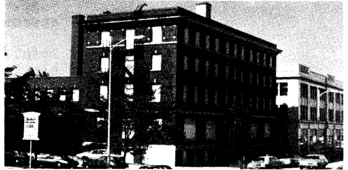
512 PUBLIC AVENUE

"THE LORD GAVE AND THE LORD HAS TAKEN AWAY. BLESSED BE THE NAME OF THE LORD." Job 1:21